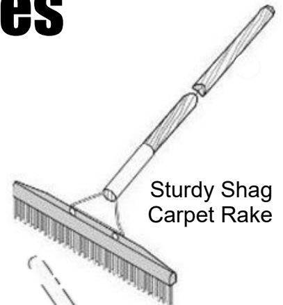
Sturdy Shag Carpet Rake